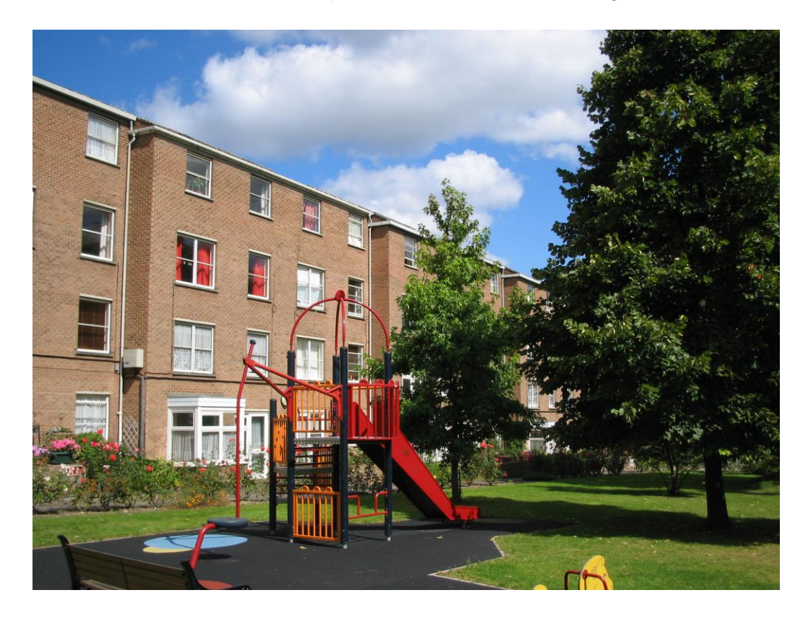
Whitby Court at Holloway Estate

Communication with the residents has continued with the review of the quarterly newsletters, regular correspondence and weekly bulletins in the notice boards. Holloway Estate is still developing their Resident Group, and there has been some workshops organised to encourage the two residents groups to sign up to time credits and advise on external funding. Facebook has recently been introduced on both Estates. This is a very new way of sending information to residents and has so far been well received although it still has a limited audience at present. After some negative feedback about customer service in a previous resident survey, staff have worked hard to improve this aspect of work and have organised a number of events and competitions for residents, including a Halloween event.