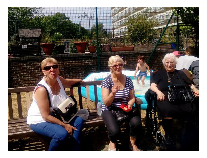
The winning picture in the Photography Competition, from York Way Estate

We have continued with the Photography Competition for the second year running, and again we received some truly stunning pictures of our estates from residents and staff. This year, the theme was 'Summer in the City' and the competition was judged by the Deputy Chairman of your Sub-Committee. Prizes were presented with their photo at Residents' Celebration Day